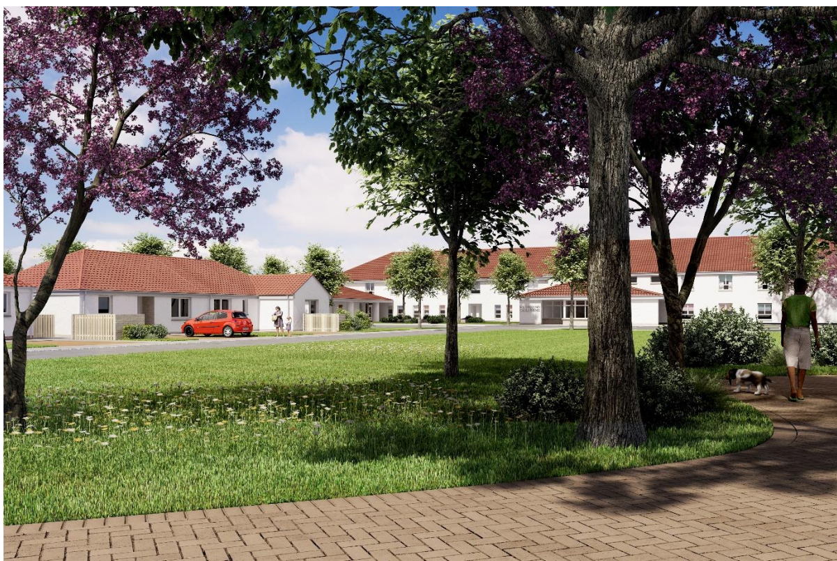
Methil Care Village (artists impression)

No Wrong Door - Our Care Village programme exemplifies our innovative approach to integrated service delivery. Methil Care Village builds on our successful previous programmes, with a partnership between Education & Children's Services, Fife Health and Social Care Partnership and Housing Services. This will provide more services within a single site by adopting an enhanced collaborative inter-generational approach. The development incorporates a central village green to provide an enhanced sense of place, combined with high quality, carbon efficient buildings.