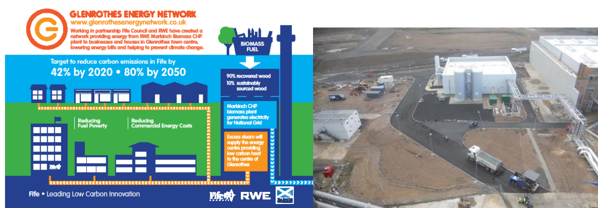
Glenrothes Energy Network

No Wrong Door - Our Care Village programme exemplifies our innovative approach to integrated service delivery. Methil Care Village builds on our successful previous programmes, with a partnership between Education & Children's Services, Fife Health and Social Care Partnership and Housing Services. This will provide more services within a single site by adopting an enhanced collaborative inter-generational approach. The development incorporates a central village green to provide an enhanced sense of place, combined with high quality, carbon efficient buildings.