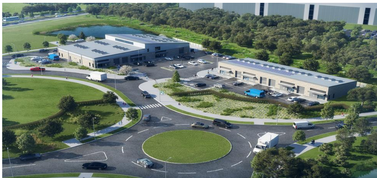
Proposed Business Units at Fife Interchange North (Artists Impression)

Fife's flagship industrial innovation investment (i3) programme is delivering new buildings and serviced sites across Fife to support our business community. The i3 programme is part of the Edinburgh and South-East Scotland City Region Deal. Our new industrial units incorporate low-carbon technology, helping address the climate emergency whilst boosting employment and helping to tackle poverty. The i3 programme will aid economic recovery and support in community wealth building, and in building resilience. Our new business units at Flemington Road in Glenrothes exemplify this approach, providing high quality, flexible business space with net-zero heating provided from Glenrothes Energy Network.