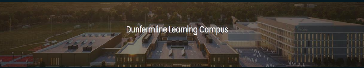
Dunfermline Learning Campus