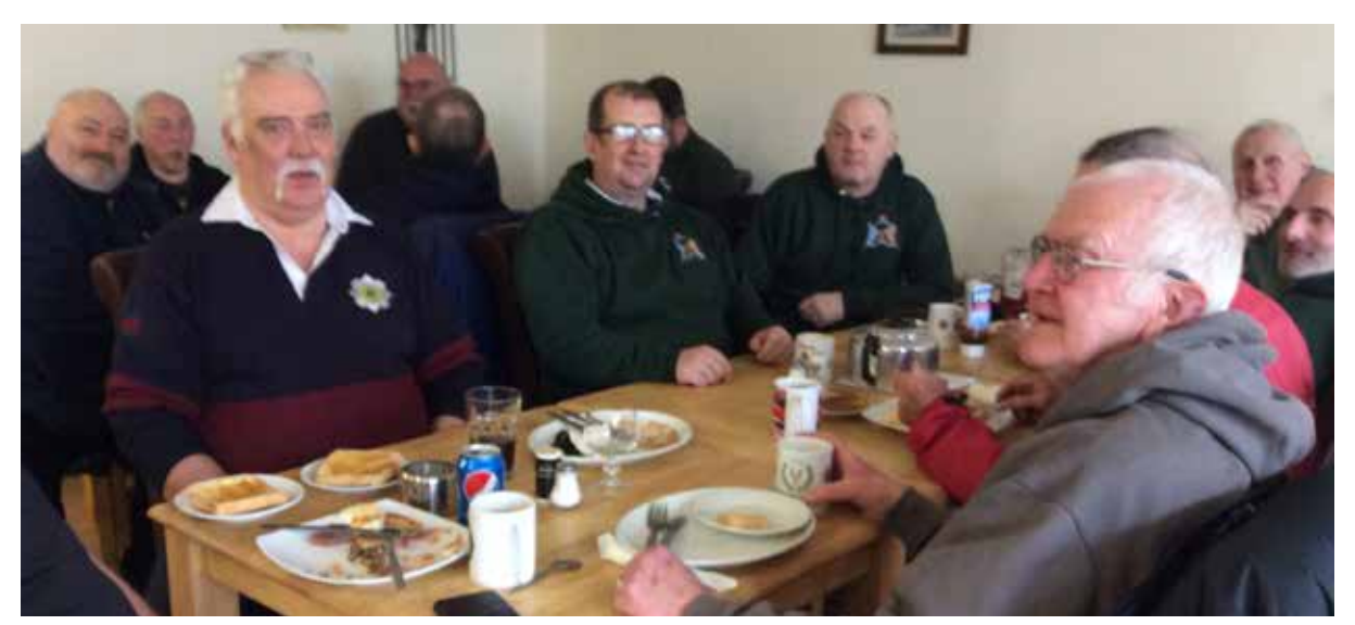
Veterans enjoying the 'banter' at Lochore breakfast club.

The Covid 19 pandemic has severely curtailed regular meetings of the Breakfast Clubs over the last two years and veterans have had to maintain contact via social media and phone calls. Fortunately, with the recent easing of restrictions this activity has been able to resume.