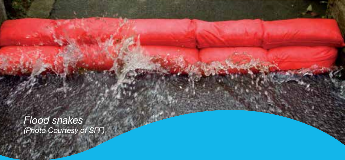
Flood snakes