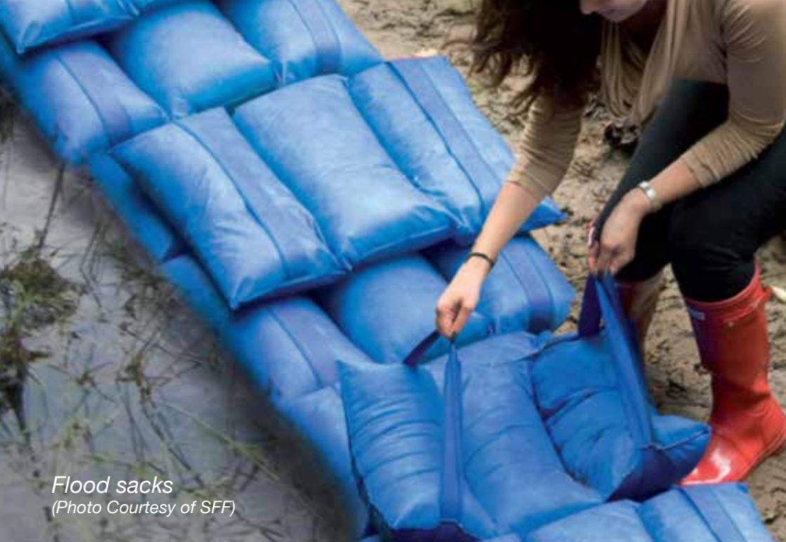
Flood sacks