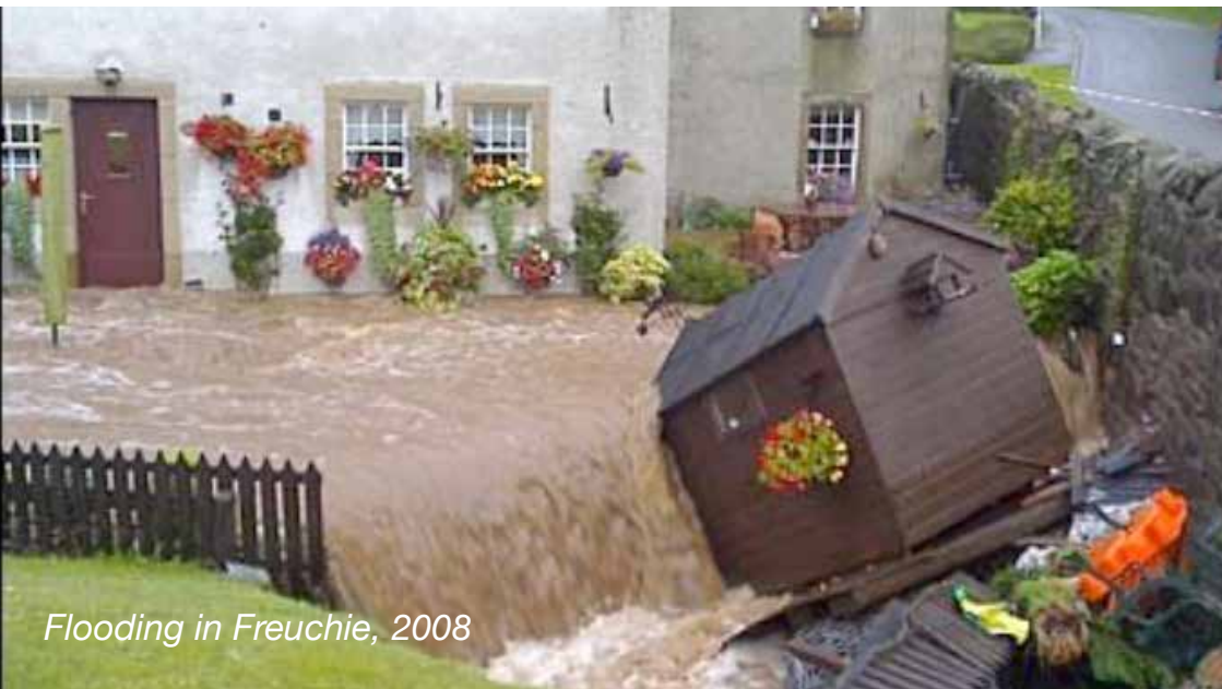
Flooding in Freuchie, 2008