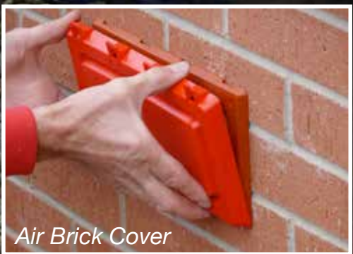
Air Brick Cover