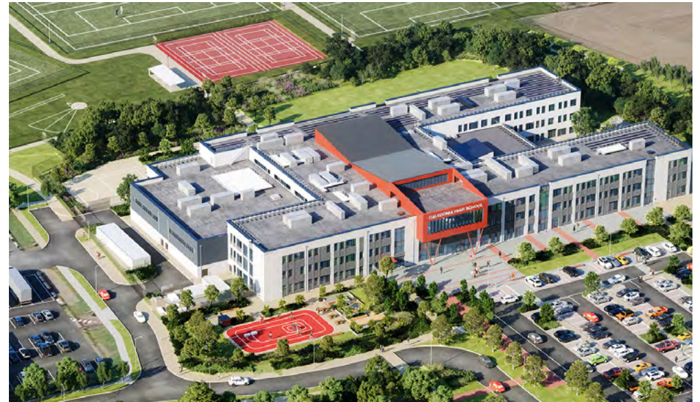
Caledonia High School, Rosyth Opening 2026

The Council operates two distinct Capital Expenditure Plans - Housing and General Fund, the latter covering all other Council Services. These are consolidated into the Council's Capital Investment Plan.