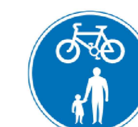
Figure 11-18 Diagram 956 (S3-2-29) Route for use by pedal cycles and pedestrians only

New shared footway width to be 4.00 metres with the exception where existing carriageway is too narrow and a minimum carriageway to be set at 6.50 metres. (As highlighted)