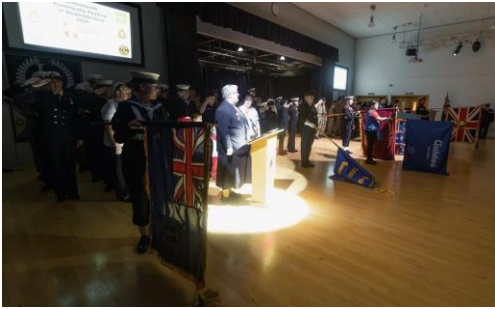
The Festival of Remembrance and Armistice Day Service in Levenmouth both involved many young people who were keen to show how they remembered those who served.

November of course was all about Remembrance and the Lieutenancy was extremely busy around Fife attending some of the wonderful services and events between the 7 th and 11 th of November. Here are some of the photos showing what went on.