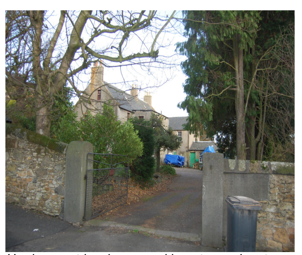
Hard cement has been used here to repair gate piers, which will cause the stonework to deteriorate over time

A further issue within the conservation area is the number of inappropriate cement repairs to stonework. Even on high status buildings such as the Session House within the grounds of the Parish Church, poor repointing with hard cement is resulting in deterioration of the stonework. The local sandstone is naturally soft, and in buildings and boundary walls where it is exposed, care must be taken to ensure that future repairs are sympathetic and lime mortar is used.