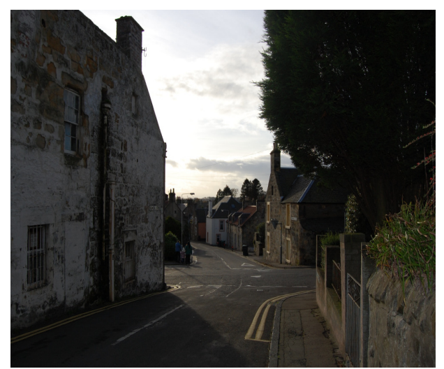
The view out of the conservation area down Commercial Street, showing the damaged gable of the Galloway Inn

The distinctive topography of the settlement itself results in an unusual roofline in the conservation area, with houses stepped up embankments or following the steep contours of streets. Notable views are not only of the Parish Church, and indeed from the churchyard over the town, but also out of the town to the rural hinterland beyond. Back lanes and gaps between the often tightly-spaced houses allow for glimpses out, relieving the hard urban form.