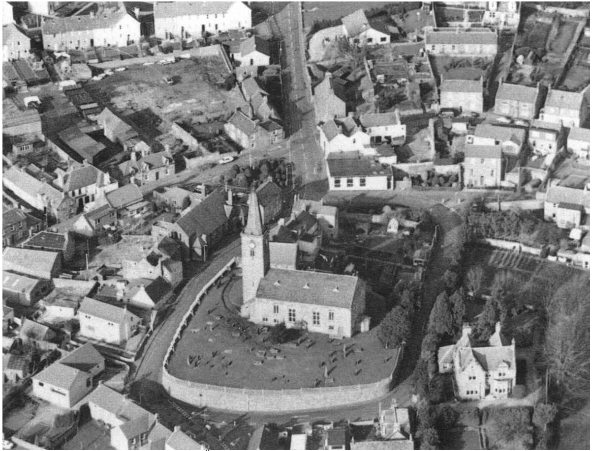
Aerial view of St Drostan's, early 20<sup>th</sup> century

alignment in the form of a ditch enclosure of a monastic settlement. Remaining distinctive today, the curved settlement pattern has been the defining feature of Markinch in the past, as illustrated by Roy's map of 1755 on p.7 and the Ordnance Survey plan of 1854 on p.6.