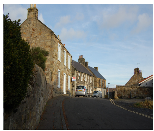
School Street, with its symmetrical late Georgian houses, including the former schoolmaster's house in the foreground