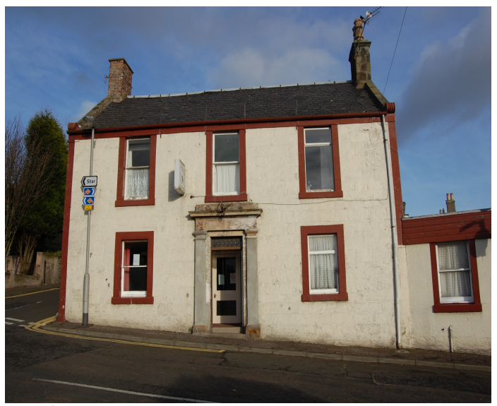
The Galloway Inn

Some backlands areas and private open spaces in the conservation area look unkempt. Whilst the variations in street pattern and architectural character can accommodate this to some extent, it essentially detracts from the overall character of the area, making these small areas appear run down. The problem may stem from issues of ownership.