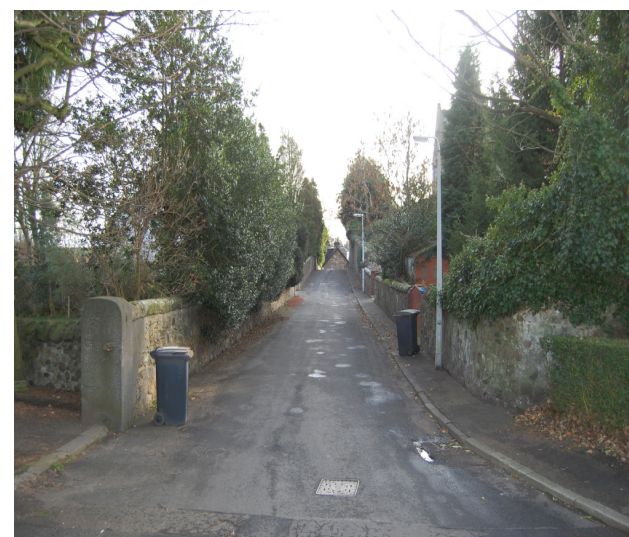
Kirk Wynd, framed by mature trees and shrubs

A single row of shops represents commercial activity within the conservation area, with the majority of buildings being domestic and a number relating to the church. The residential properties with shops at ground floor level at the corner of Croft Road and Commercial Street are early 19<sup>th</sup> century, and have largely retained a traditional design of shop front. Directly opposite cross the road a harled building presents a