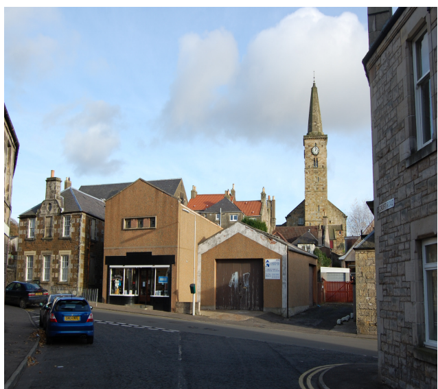
1950s shop front opposite, with the Church tower in the background