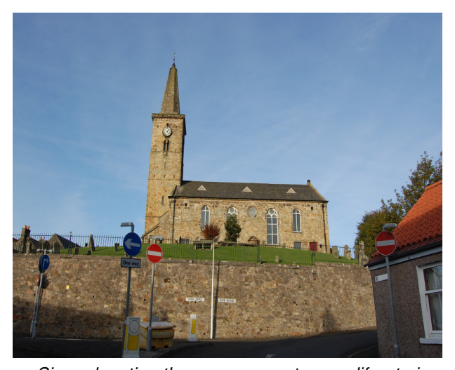
Signs denoting the one way system proliferate in front of the Church's retaining wall