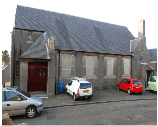
Blocked windows give an impression of disuse

The Church Hall opposite the entrance to the Parish Church is in use, but the blocked and barred windows present a blank façade to the street and what could be a positive building within the conservation area is compromised. In future, alternative safety options might be considered for the windows.