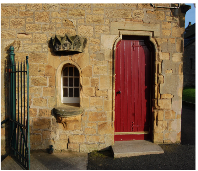
Medieval stonework incorporated into the fabric of the session house is one of the architectural details that hint at Markinch's history

Unlike the coastal Fife vernacular roofs are slate more often than pantile, but the occasional similarity is evident, as in the scroll and cable skewputts that are a distinctive feature throughout Markinch, as seen at the former Galloway Inn; and the single storey pantiled weavers' cottages on Stobcross Road. These reference the vernacular style that would have been prevalent in an earlier phase of buildings around the Church in the period after the town became a Burgh of Barony, as mentioned in the previous section. The similar buildings on the north side have been demolished, but a marriage stone of 1715 remains built in to the later wall. Graded Scots slate can be seen on several buildings in the conservation area, contrasted with unsympathetic re-roofing in uniform Welsh or Spanish slate on neighbouring buildings. As salvage is now the only source of Scots slate, it is very important that remaining Scots slate roofs are well maintained to ensure their retention.