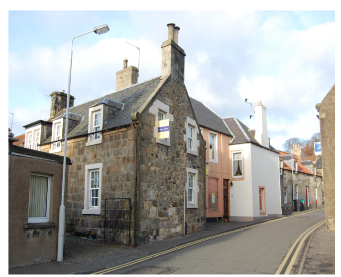
Variation in the building line adds interest to the streetscape