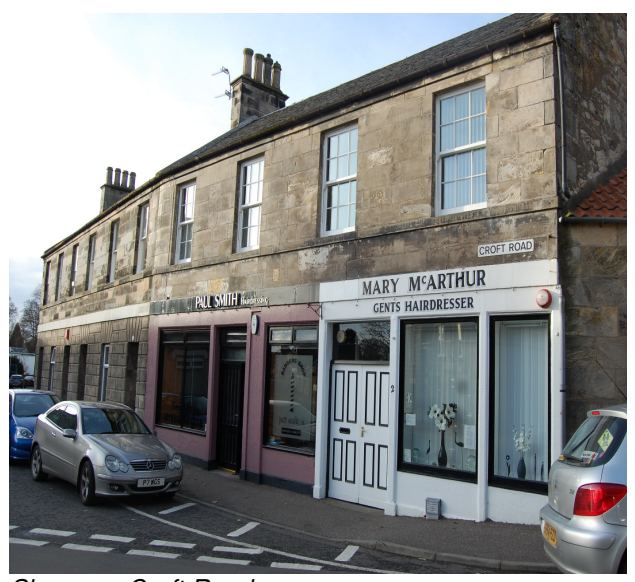
Shops on Croft Road

This lack of extensive commercial activity in the conservation area itself today is part of its distinct character, maintaining a separation from the busier southern part of Markinch where shops and public buildings are concentrated, and the larger part of the pedestrian and other traffic is focused.