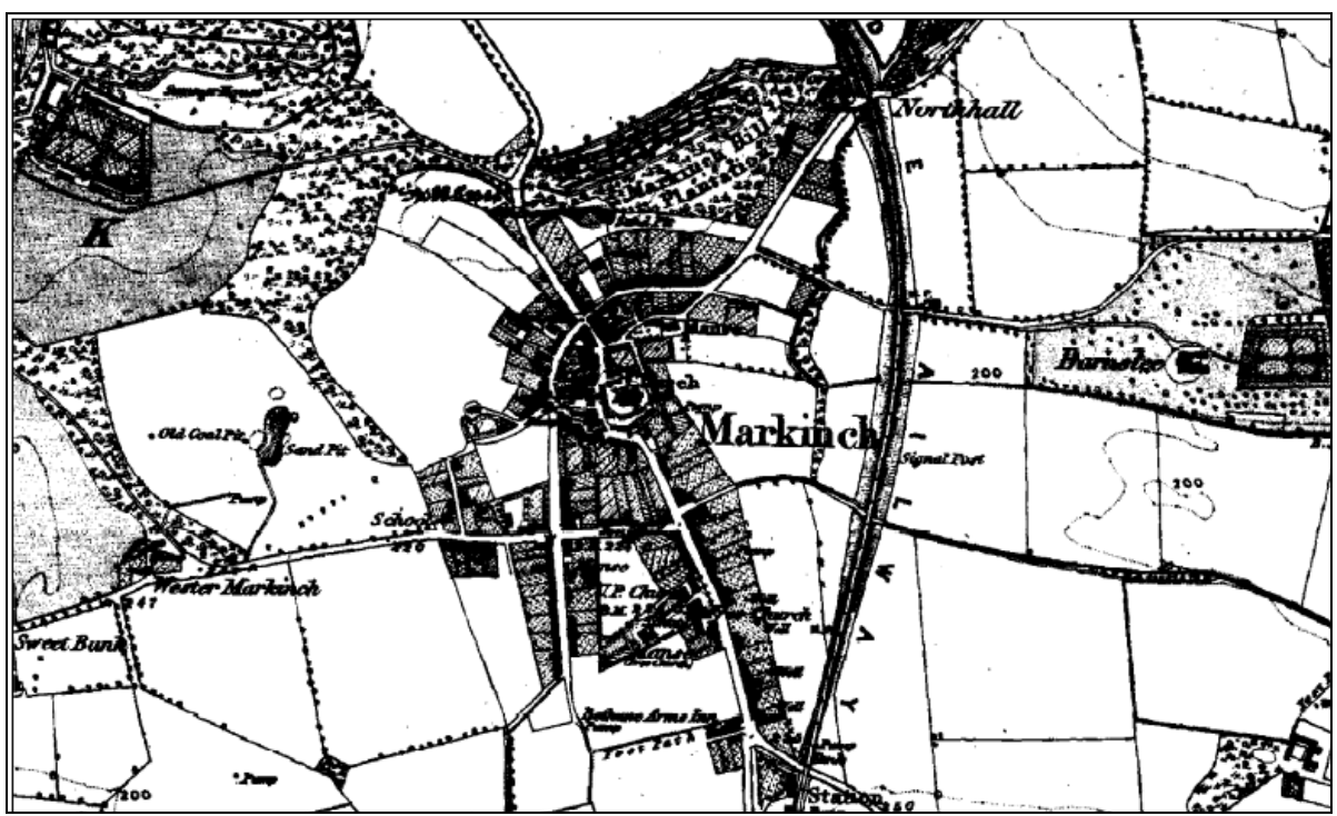
OS Plan of Markinch 1854

In 1673 Markinch was granted the status of a Burgh of Barony, with the right to trade leading to an expansion of housing around the Mercat Cross and the Kirk. The Mercat Cross was situated outside the gate of the Kirk and was removed to facilitate the movement of materials for the Earl of Leven's grave.