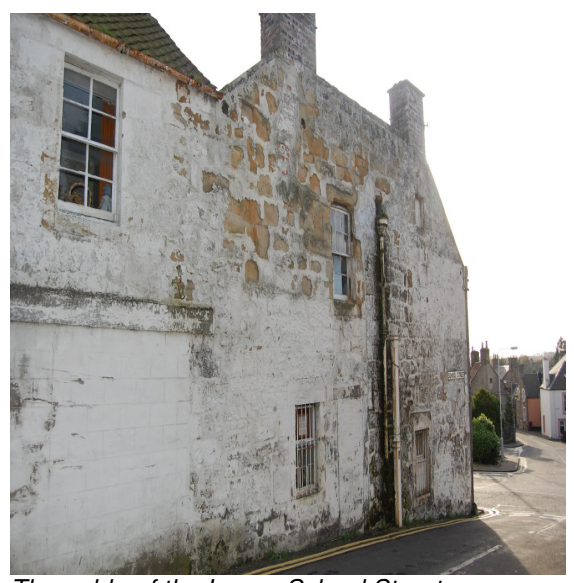
The gable of the Inn on School Street, illustrating general disrepair

A number of buildings within the conservation area also appear to be unused or are not being adequately maintained. The Galloway Inn is possibly the most highly visible of these, particularly as it has obviously once been a positive addition to the street. Its