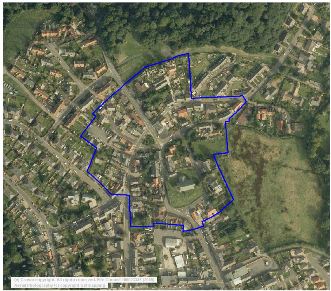
Aerial view of Markinch, with the conservation area boundary in blue, illustrating the unusual street pattern

The street pattern is of interest where, as previously noted, the streets curve around Kirk Brae. Georgian and later buildings now characterise the area, but some buildings that remain from an earlier period of small thatched cottages can be identified by the steep roof pitch, with thatch having been replaced by slate or pantile. Back lanes are also a feature of the unusual street pattern. The longer, straighter streets of the Georgian and Victorian expansion move south towards the train station, which would have been an equally vital focus for the town following the arrival of rail transport.