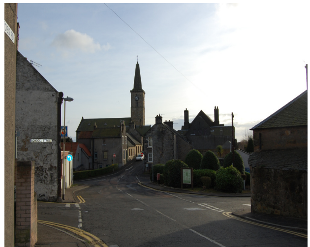
The landscaped public area on Commercial St.

Some of the one-way streets within the conservation area lack footways and retain an almost unfinished appearance. This is not of itself detrimental, highlighting as it does the domestic aspect of this part of Markinch.