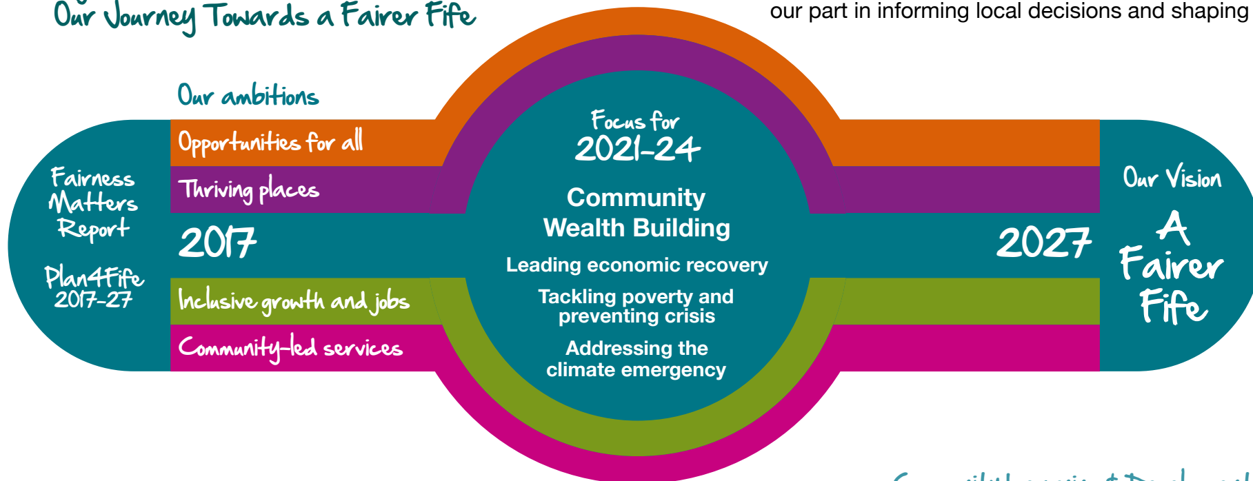
Figure 1: Our Journey Towards a Fairer Fife

We will use these themes to inform our CLD priorities over the next three years to help our communities become not just wealthier but healthier and greener too. We hope it will stimulate conversations locally about what needs to change next and how we can all play our part in informing local decisions and shaping future services.